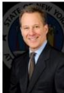
Eric T. Schneiderman Attorney General